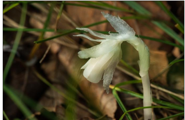
Indian Pipe on Roan Mtn