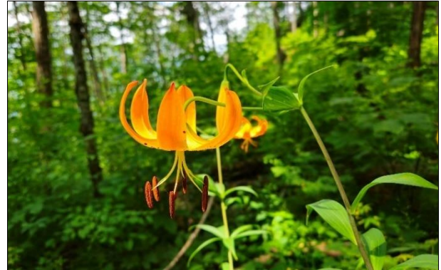
Turk's Cap Lily on the A.T.