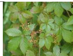
Virginia Creeper ( Parthenocissus quinquefolia )