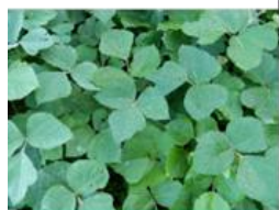
Kudzu ( Pueraria montana )