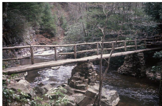
Stewart Koonford Bridge (1990)

Koonford Bridge is now a 66' long by 4' wide span crossing the Laurel Fork in a deep gorge near where a railroad trestle once traversed the stream between Hampton and Dennis Cove. No references were found for how the bridge was named. It has been replaced several times over the years. The 1960 A.T. Guide Book describes it as a simple log bridge, likely two-foot wide of locust tied together to form a deck. In 1985, the Konnarock Crew and TEHCC added handrails and decking to the existing logs on the rock pillar supports. When the area was designated as Pond Mountain Wilderness, the decision was made to replace the bridge to be compatible with the new designation. The Konnarock Crew and club in 1990 swapped the Koonford Bridge over three long weekends with a design that involved no hardware (dovetail joints). The two rock piers were raised by about 15 inches while a third (northern) span was added. This effort, resulting in a structure with an appearance keeping with the wilderness area, thus won a Primitive Skills award.