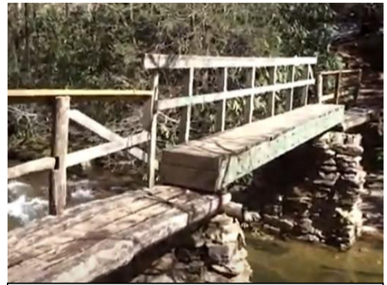
Repair After 1998 Flood

To finish this story, the two lower bridges were replaced in April 1999. Because Laurel Fork Gorge is in the Pond Mountain Wilderness Area, the replacements had to be rustic in appearance and constructed using non-mechanized means (no power tools or transportation). Due to the 40+ foot length of the stringers (the long poles that are the bridge's backbone) and wilderness area requirements, TEHCC informed the Cherokee National Forest that the club could not complete the project. USFS chose to use a private contractor to replace the bridges. To move the stringers, the firm employed a team of mules dragging the logs to the bridge sites. The bridges were built out of landscaping timbers, which the club has been steadily replacing over the years as they deteriorate.