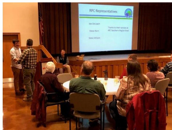
Recognition of RPC Representatives

* Note that many more maintainers qualified for this recognition, but already have an NPS Golden Pass, and thus declined to receive another pass.