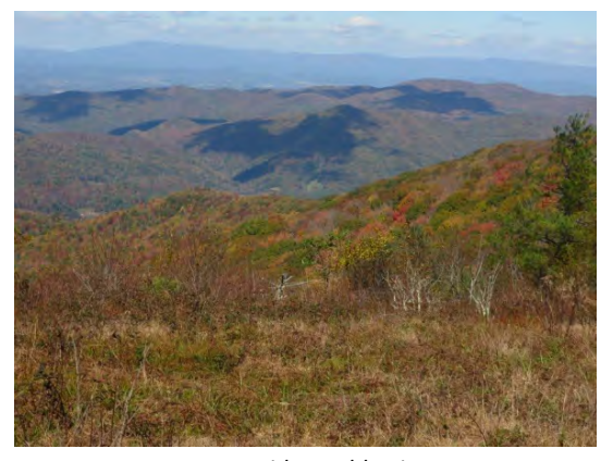
Rogers Ridge Balds View

The hike begins with an immediate creek crossing that has neither a bridge nor decent rocks to hop across; but this will be the last time you see water. Although guide books mention some campsites along the way with water access, we didn't see them. The trail wastes no time getting to the 3,201 feet of