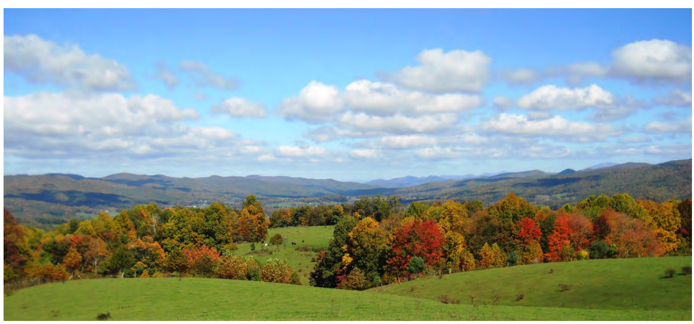
Looking north from Osborne Farm

The cold and rainy day prior turned into a beautiful autumn Sunday afternoon; however, I ended up hiking alone, although a dozen backpackers were seen proceeding north on the Trail and one south. The fall color was a few days before peak with some individual trees providing dazzling displays. The hike started as planned with the 0.8-mile crossing of the open farm pasture with views north up the valley. The cattle were ready to be let in from the middle field to be fed at the barn. The walk continued roughly another half hour into the woods, and then returned to the parking lot. I decided to check out the new trail relocation south of the Cross Mountain parking lot, so proceeded a mile south just past the bog bridges. The falling leaves allowed the tread to be less muddy. With the remaining afternoon, I visited two places at Shady Valley managed by The Nature Conservancy at Schoolyard Springs and Orchard Bog. The winding drive on US 421 was enjoyed in the fading daylight.