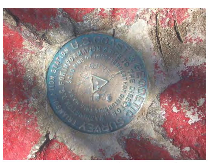
NC-VA-TN Corner Triangulation Station Disk