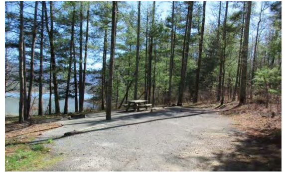
Typical Little Oak Campsite