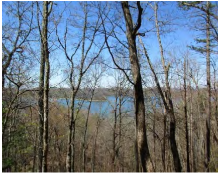
View of South Holston