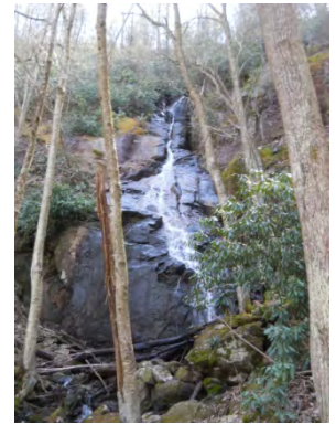
Coon Den Falls

The solo hikes to two waterfalls were enjoyed as planned. The loop of A.T., Coon Den Falls Trail, and roadway was completed in two hours. I was very glad that the Appalachian Trail was relocated off the now blue-blazed Coon Den Fall Trail, as the latter is very steep in places. The ~60-ft high Coon Den Falls was flowing well in a thin ribbon. The in-out hike to 50-ft high and wide Laurel Falls also required two hours as I picked up trash along the steep steps and engaged several hiking couples in conversation. During this hike section, I was finally able to admire the new Koonford Bridge! Got back home at 7 pm as planned.