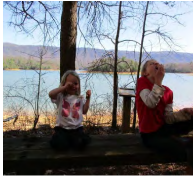
Pretending to be tired or just wanting to snack?