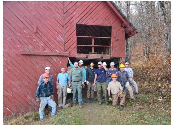
Saying Goodbye to Overmountain Shelter (see article below)