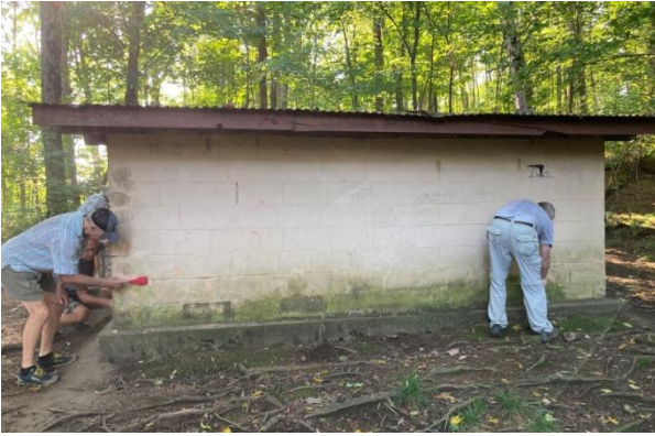
Cherry Gap Shelter – Before (or during)...