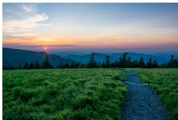
Roan Mountain: A path leading to a grassy hill