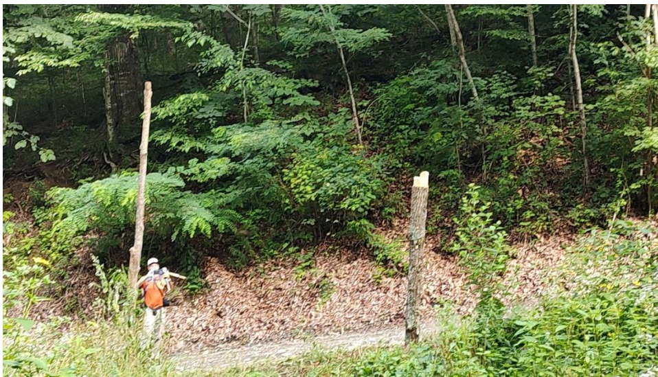
Shell Creek Gate Posts to Doll Flats