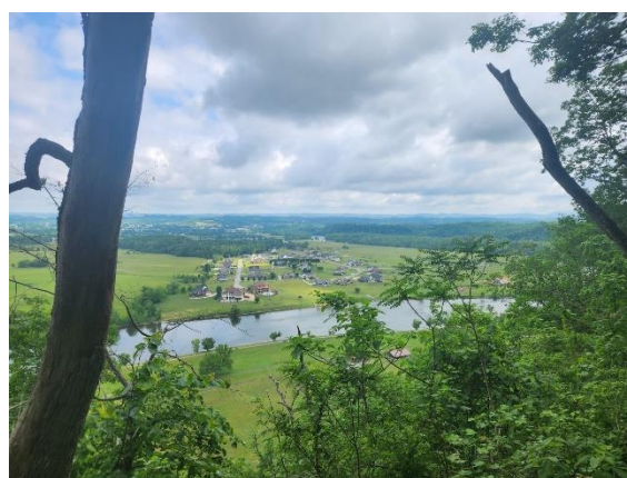
Northern View from Canebrake Mountain Overlook