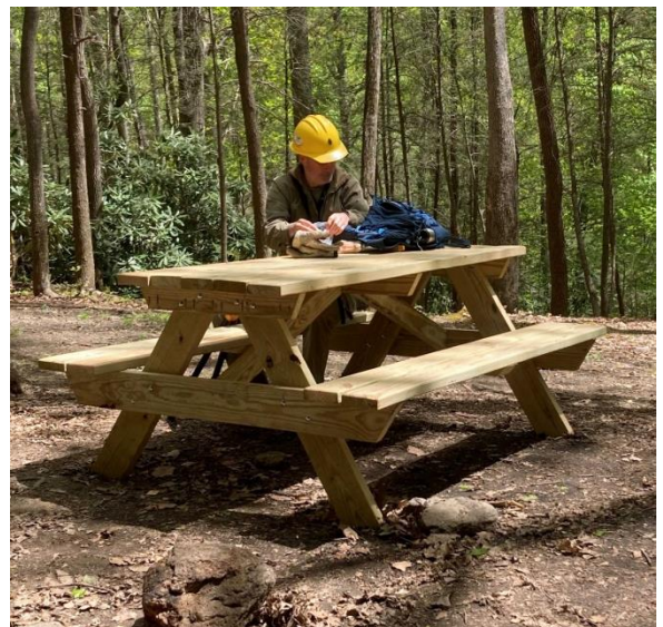
New picnic table at No Business Knob Shelter