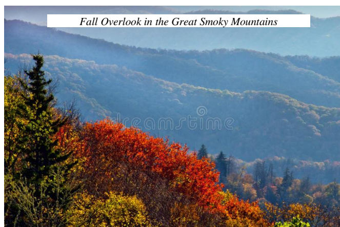
Fall Overlook in the Great Smoky Mountains