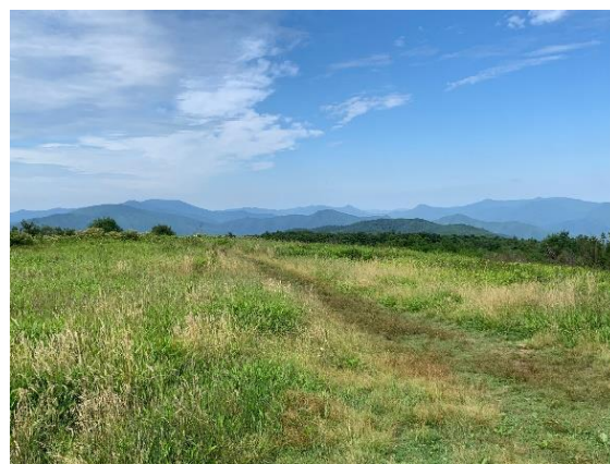
A.T.: Beauty Spot