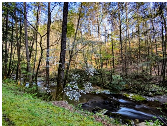
Great Smoky Mountains NP.