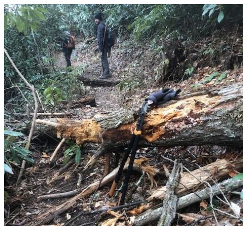
Sugar Hollow Creek – Campbell Hollow Rd Section