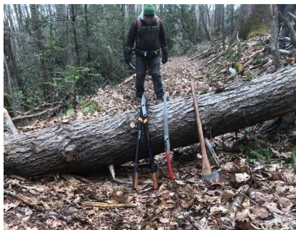
Blowdown south of Mountaineer Falls

Summary: High wind warnings had been issued by the weather service with gusts of up to 30 mph forecasted. While on the trail, we had a large limb fall within 20 feet of us. Along the trail, we cleaned water diversions, cut back encroaching vegetation, and picked up trash. There are a large number of dead pines along this section. We removed 6 dead pine blowdowns 6-12" diameter and 2 poplars about 10" diameter. We were unable to remove one large pine blowdown south of Mountaineer Falls about 100 yards south of the foot bridge. We left another dead pine blowdown on the Sugar Hollow Creek - Campbell Hollow Rd section between Elk River and the cutoff trail to Elk River Falls (see photos). We encounter 4 thru-hikers and several section hikers. While returning to our car on Walnut Mountain Rd, we stopped to clear some limbs from the road, and a large dead pine fell about 30 feet away on to the edge of the road where we were parked.