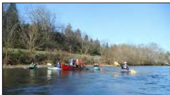
North Fork of the Holston (November 2015)