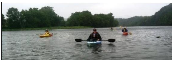
Exploring the Holston: Church Hill to Christian's Bend July 2011