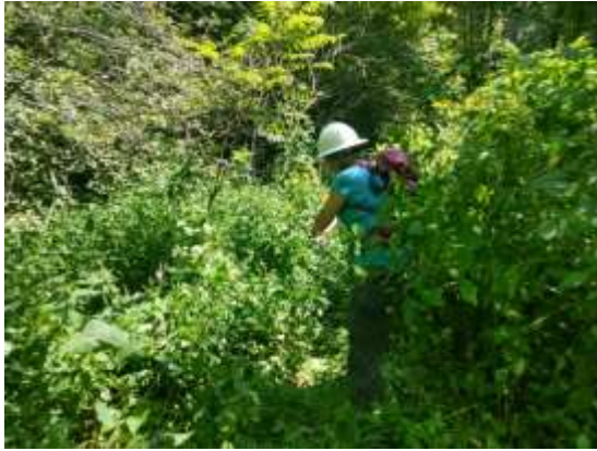
The Weeds at Beauty Spot Gap

Summary: We cut the weeds and repainted the blue blazes to the water source at the northern end of Beauty Spot Gap aka Low Gap. The weeds were near head high and it is doubtful that hikers were finding this water source. The piped spring was flowing well; much better than the other water source at the southern end of the gap. We tried to re-position the pipe, but there is not enough water flow at this source to feed the pipe. Lori also cut back the stinging nettle to this water source. The blue blazes looked okay and when the rain started, we decided they were good enough.