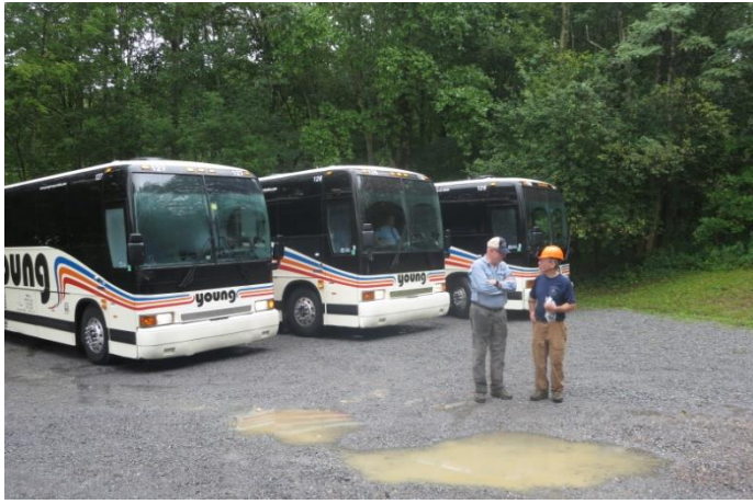
Making last minute plans