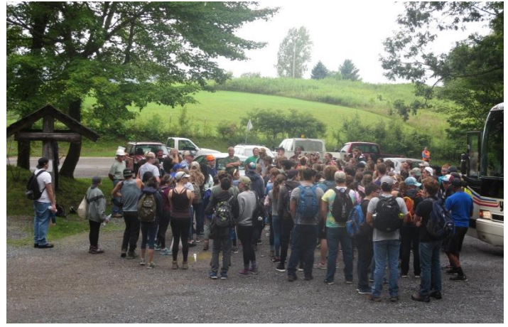
Getting ready to go to the work site