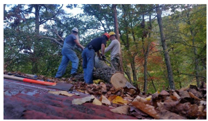
Blowdowns atop Laurel Falls Shelter