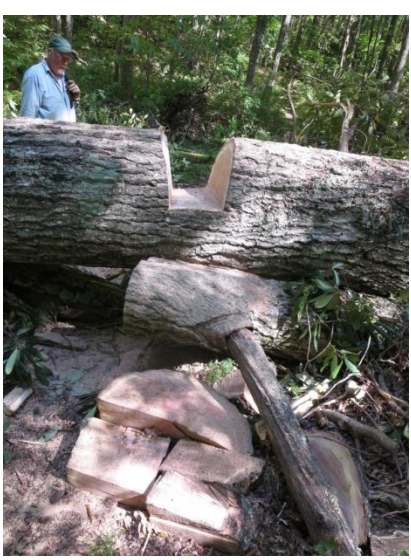
A huge blowdown - even bigger than reported!