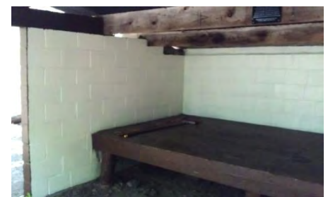
Moreland Gap Shelter - After