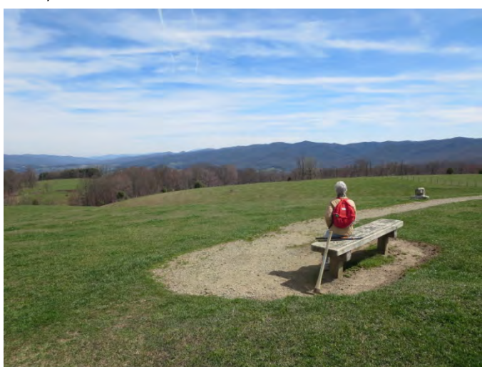
Enjoying the beautiful view from Osborne Farm