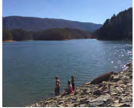
Returning the rocks to the lake