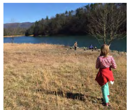
Snack break at the spillway