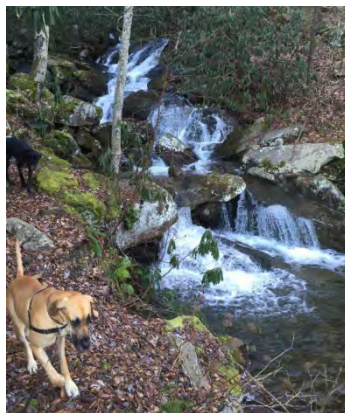
Falls at the trailhead