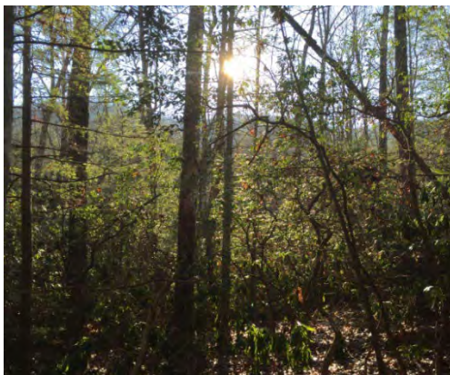
A beautiful morning