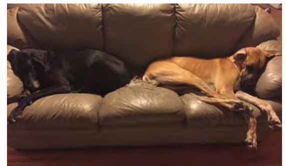
Zoinks and Beetle post Roaring Branch hike