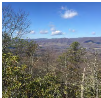
High Butte south view