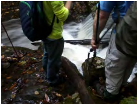
Options are considered for crossing a rain-swollen stream on the way to the falls

Two TEHCC hikers met up with 9 MAHC hikers for a bit more of a hiking adventure than anticipated. We left Kingsport in a light rain, but by the time we neared Dungannon the clouds parted and we were rewarded with a nice autumn day. However, due to the recent heavy rains, water levels were very high. If the person who named Little Stoney Creek had first seen it the day we were there, it would have been called Big Stoney River with Rapids! Rocks and fallen leaves on the trail were very slick from the rain and the trail was under standing water in some places. One stream crossing normally done via rock hopping required assistance from fellow hikers by grabbing onto a log and helping hands to make the leap over rapidly moving water. The upper and lower falls were quite impressive and much larger than anyone on the hike remembered from past years. We enjoyed the adventure, as well as the fall colors. We will perhaps try another joint hike in the spring and hope for more TEHCC participation in the future. J. Liu and hike leader R. Blankenbecler comprised the TEHCC contingent on this excellent adventure.