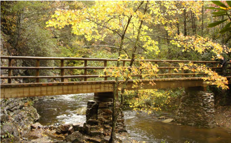
The gorgeous new Koonford Bridge!