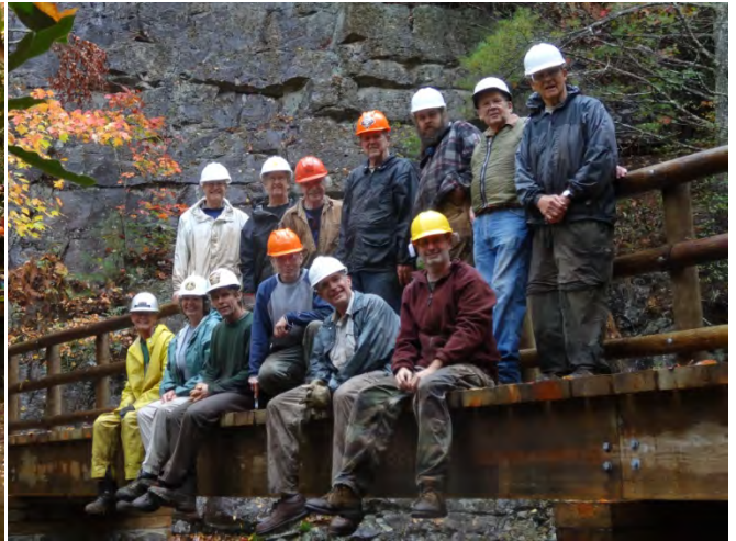
Koonford Bridge crew