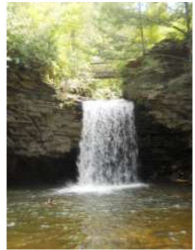
Upper Plunge Falls