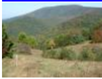
First view of Big Bald