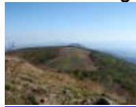
View from our lunch spot on Big Bald