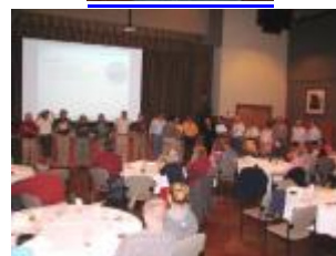
Awarding of the 60th Anniversary Hats