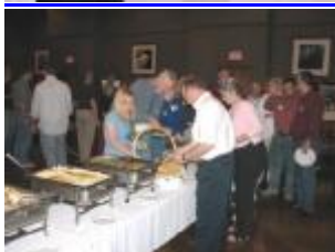
Lining up for Troutdale's dinner offering