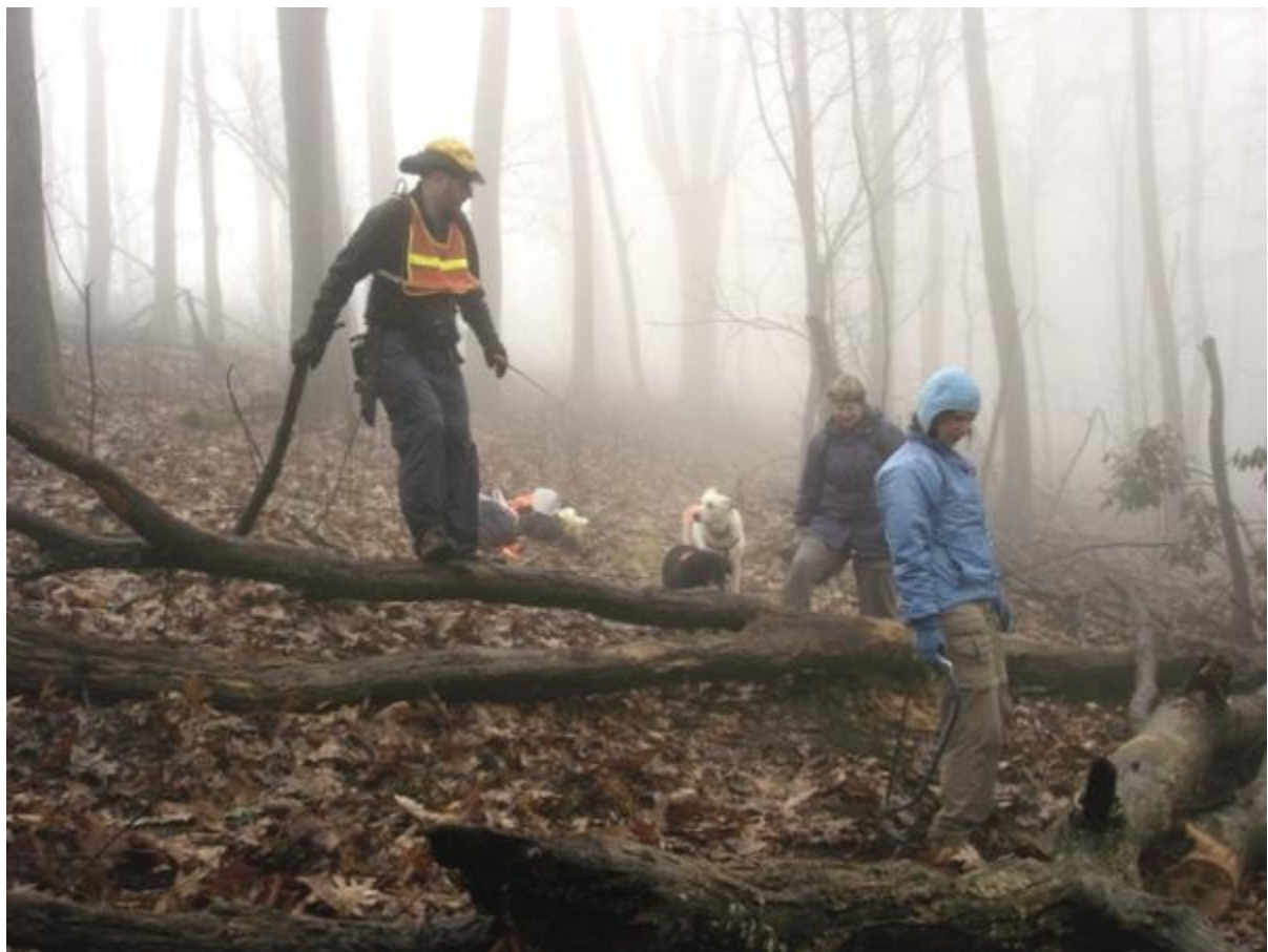
About half-way through done!