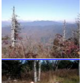
View of Mt. LeConte from the A.T.