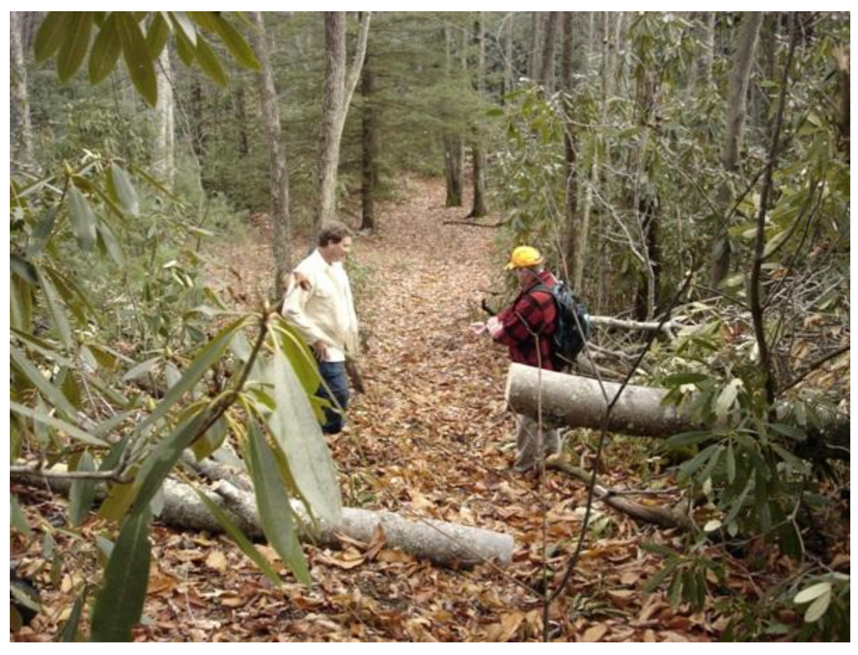
The trail is clear!