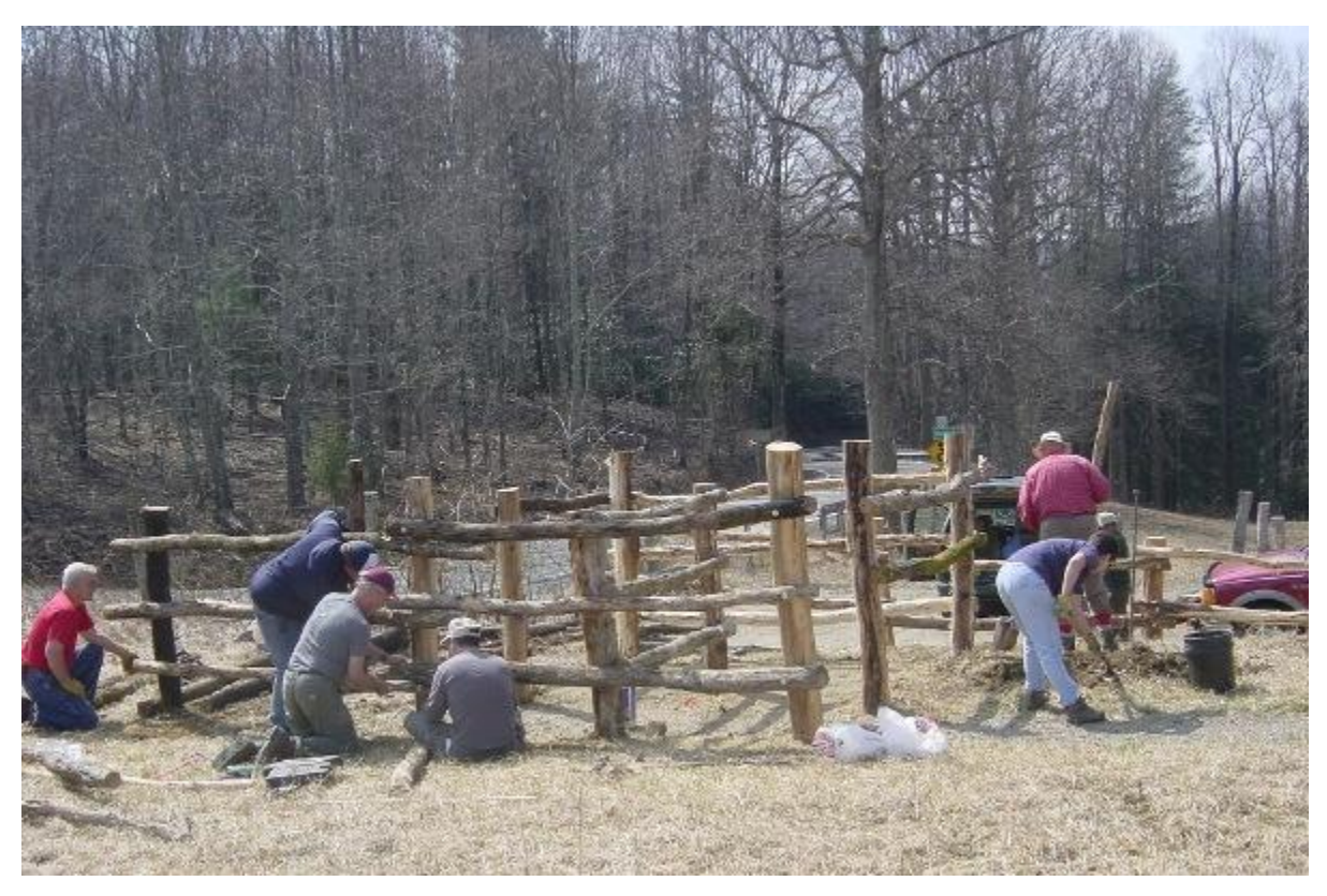
Installing the stile at the Osborne Tract

L.L. Bean also provided us a little over $1200 for three grants through the ATC Grants for Clubs programs. With these funds we were able to totally replace the sleeping platform and its support in Abingdon Gap Shelter. The old plywood platform had been installed over log bunks and the logs were flexing. We also installed a new bog bridge and redid a couple of bog bridges just south of Campbell Hollow Road.