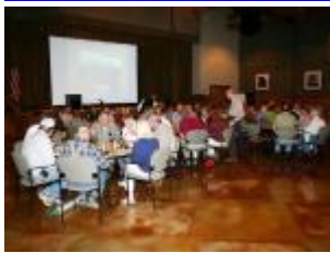
Everyone enjoying dinner