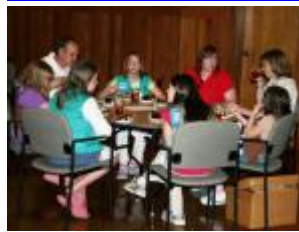
Girl Scout troop guests who provided the table decorations