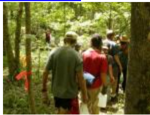
Heading out at the end of the day Monday, Dinner at Kincora Hostel,