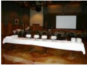
Setting up the Lodge for dinner

click on a image to see full size.