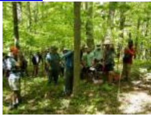
Painting blazes on finished trail,