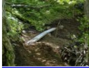
The finished bog bridge, More sidehill construction on Monday