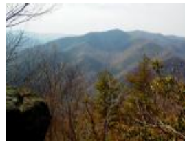
View from Sugarland Mountain Trail