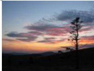
Sunset from our campsite