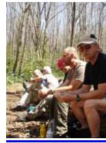
Lunchtime at campsite #24