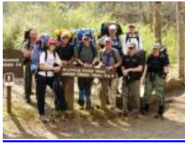
Group at start of hike

click on an image to enlarge