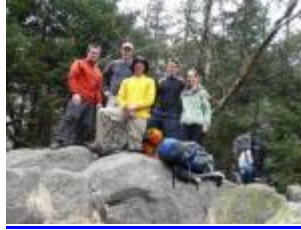
On top of Mount Rogers, Virginia's highest mountain peak