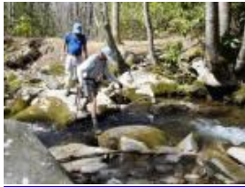
Chuck negotiates a creek crossing