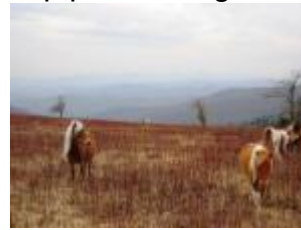
Wild ponies along the A.T.