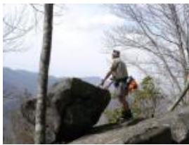
Garry admires the view along the Sugarland Mountain trail