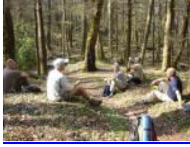
Taking a break on the Rough Creek Trail