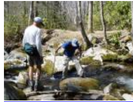
Taylor crossing creek on way to campsite #30