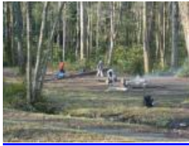
Leaving campsite #24