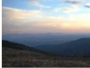
Overlooking the mountains from our campsite