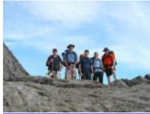
Group photo along the A.T.