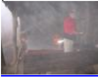
Half of New Sleeping Platform at Overmountain Shelter - Paul Benfield.

Summary: Although we were in fog and light rain all day with 25 feet of visibility, we had a productive day. We installed the six sheets of painted plywood on the ground level sleeping platform.