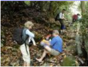
After the creek crossing