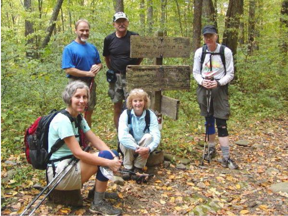
Click on photo to enlarge.