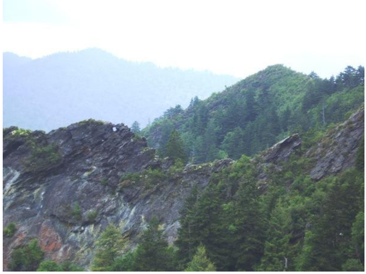
Eye of the Needle from Alum Cave Trail