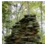
Old chimney near Timothy Creek (128 kB).

Click on small photo or hyperlink to see larger photo.