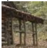
Tyson McCarter barn built around 1876 (192 kB).