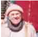
Iron Mountain " bush crew " (157 kB).

Click on small photo or hyperlink to see larger photo.