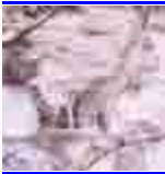
Laurel Falls (191KB).