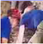
Lifting a rock (175KB).