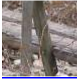
Old bridge (236 KB).

Click on the small photo or hyperlink to see a larger photo.