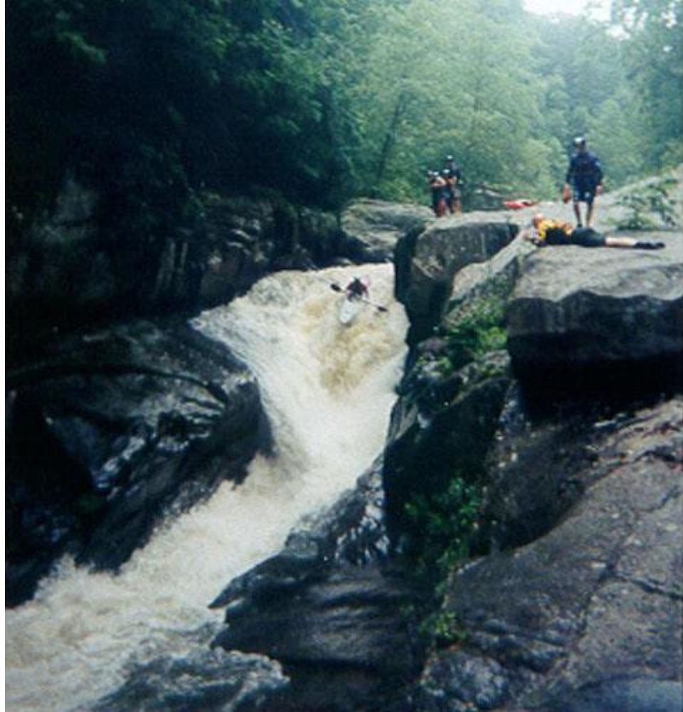
Gorilla Rapids on the Narrows of the Green near Saluda, N.C.